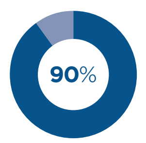
Percent of principal fellows who reported they felt "job-ready" following their in-school residency

Growing leadership is often seen as a back-burner priority, but too often that results in the least prepared principals being placed in the schools that most need effective leaders. However, the NIET-TTU partnership shows how investing in hands-on, expert training can create a pipeline of talented leaders who can improve the educational experience for students in some of Texas' most challenged districts — and it has proven to be a model other institutions can follow.