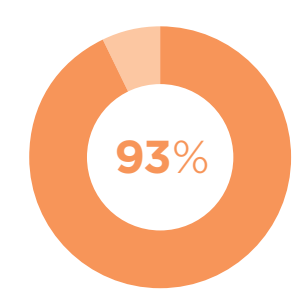
Percent of principal fellows who rated their experience as good or excellent