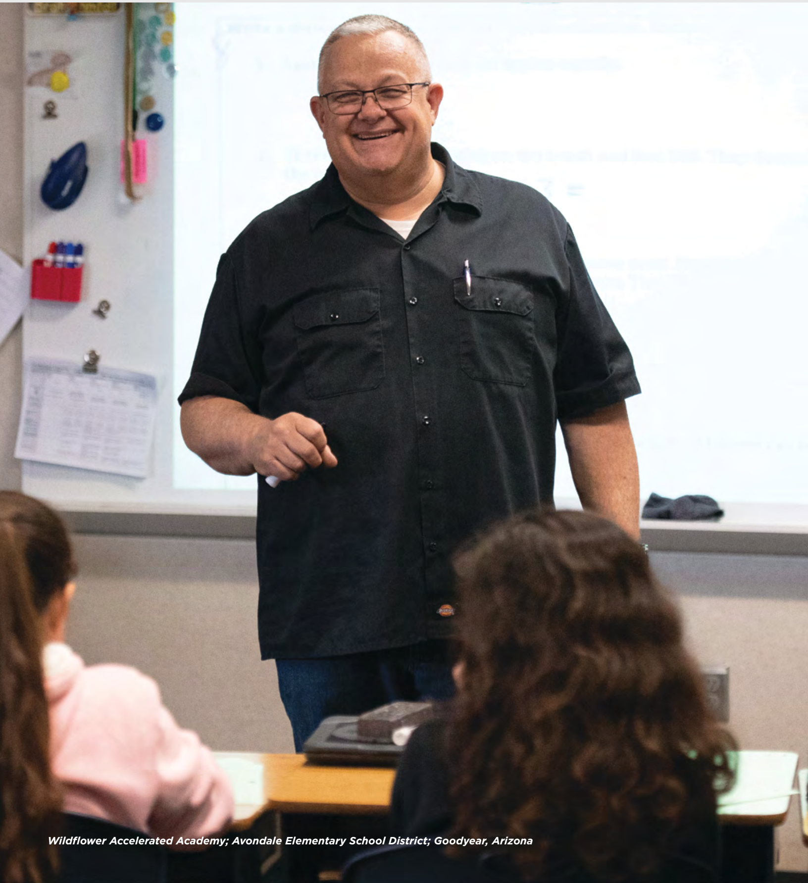
Wildflower Accelerated Academy; Avondale Elementary School District; Goodyear, Arizona