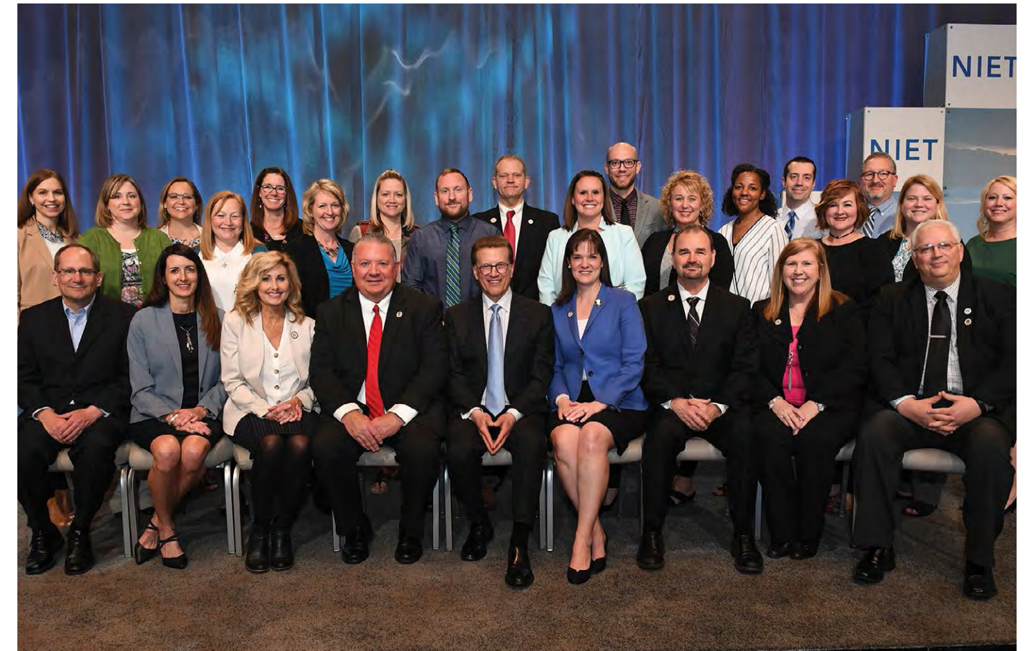
Perry Township Schools brought its district leadership team and several school and teacher leaders to the 2019 NIET Annual Conference, where attendees heard more of the story behind their District Award of Excellence for Educator Effectiveness. With a growing refugee population resulting in nearly a third of students being classified as English learners and rising economic need, Perry Township doubled down on excellent instruction, and over the past few years, student progress has consistently improved for all students. Perry Township's proficiency rates now exceed the state average, and they have continued to push themselves to do even more.