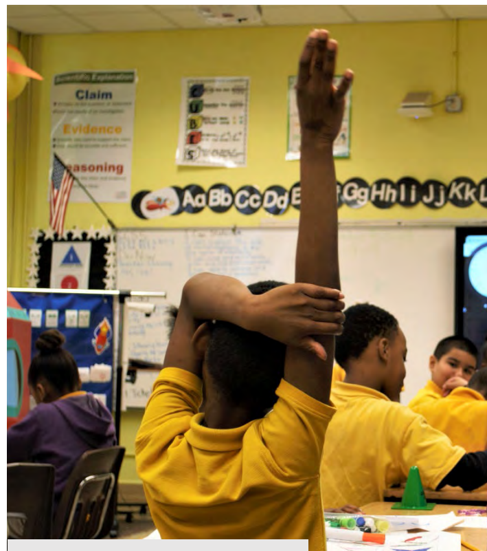
Caddo Parish, Louisiana

Intensive, one-on-one coaching is particularly important in low-performing schools, where teachers will need additional support in helping students who are significantly below grade level. The use of a high-quality curriculum provided to every school relieves instructional leaders of the overwhelming responsibility of designing and supporting multiple curricula or lesson planning on their own and enables them to focus on building content knowledge, improving teacher practice, and analyzing the effect of instructional strategies on student learning.